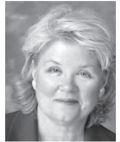
Kit Pepper Orange County